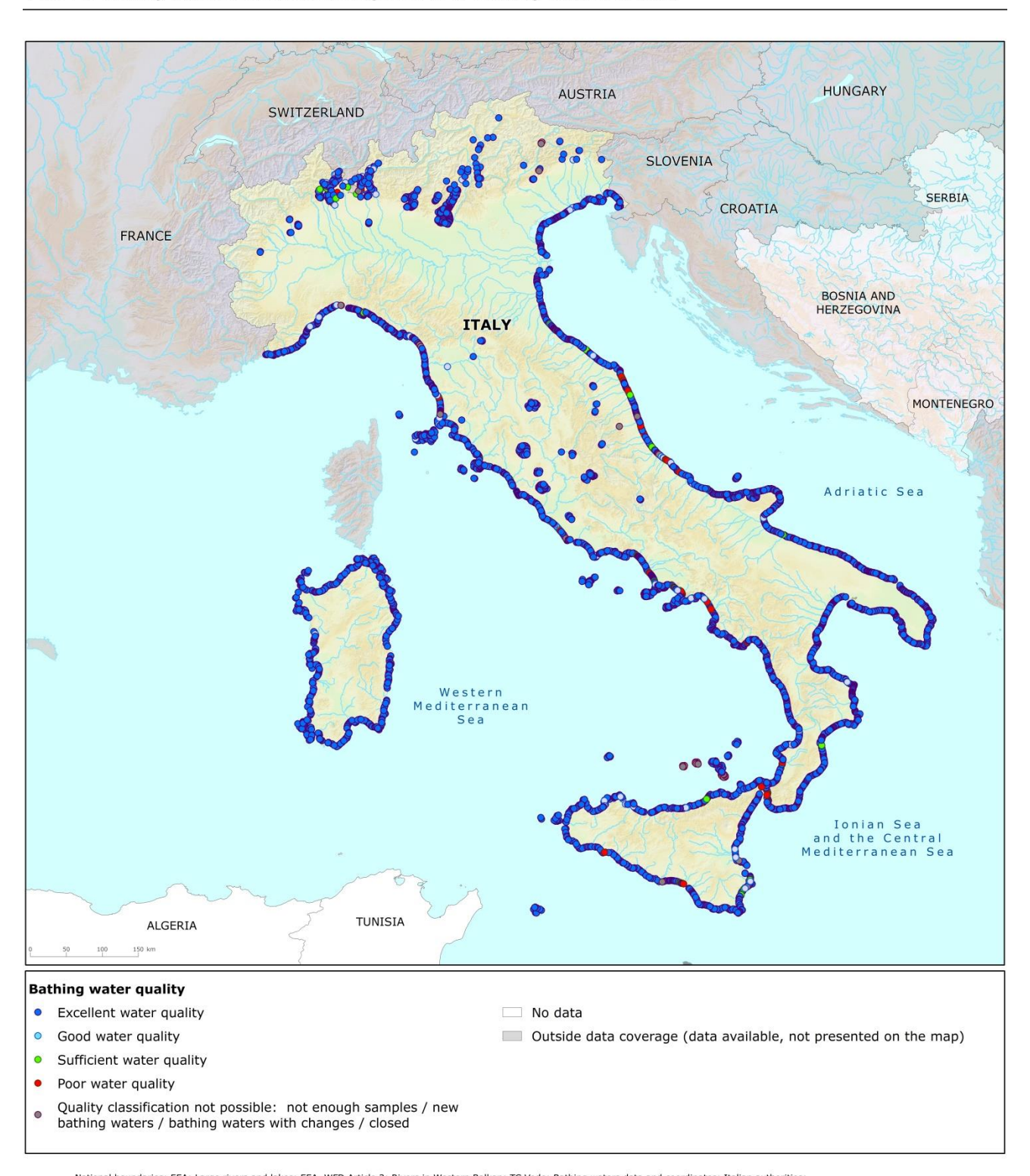
Map 1: Bathing waters reported during the 2016 bathing season in Italy